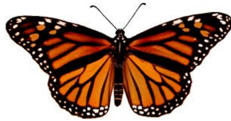
FEMALE MONARCH BUTTERFLY

DATE – Record the entire date (month, day, year)