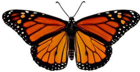
MALE MONARCH BUTTERFLY

Males have thinner vein pigmentation and a black “dot” (a hindwing pouch) on the hindwing, as well as claspers on the end of the abdomen. Females have thicker vein pigmentation, no black dots on the hindwing, and no claspers on the end of the abdomen. See illustration below.